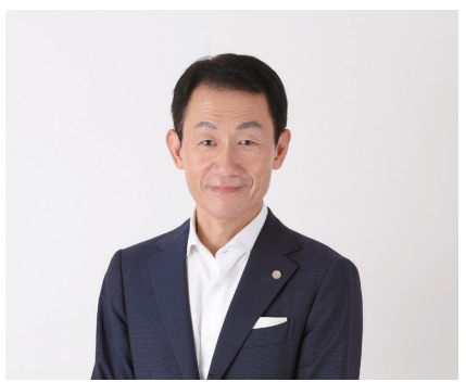
Outside Director Born in 1958